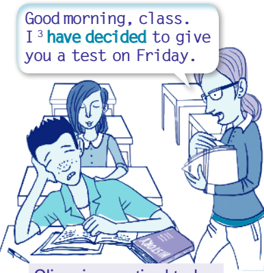
Oliver is very tired today.