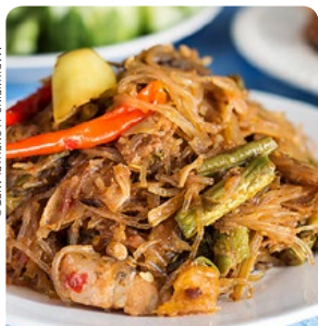
STIR-FRIED CURRY NOODLES P44