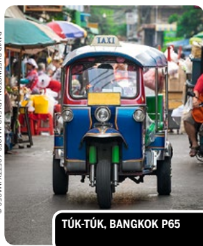
TUK-TUK, BANGKOK P65

Phetchaburi ..... 492 Kaeng Krachan National Park ..... 496 Cha-am ..... 498 Hua Hin ..... 500 Pranburi & Around..... 508