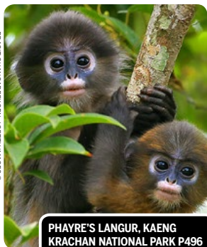
PHAYRE'S LANGUR, KAENG KRACHAN NATIONAL PARK P496