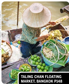
TALING CHAN FLOATING MARKET, BANGKOK P148