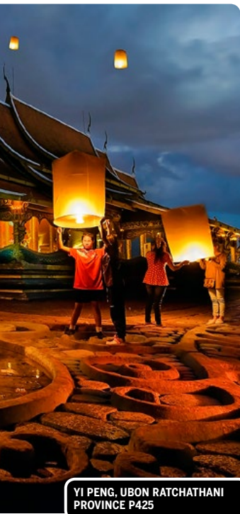
YI PENG, UBON RATCHATHANI PROVINCE P425