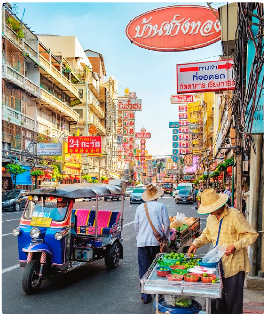
Top: Chinatown (p81), Bangkok