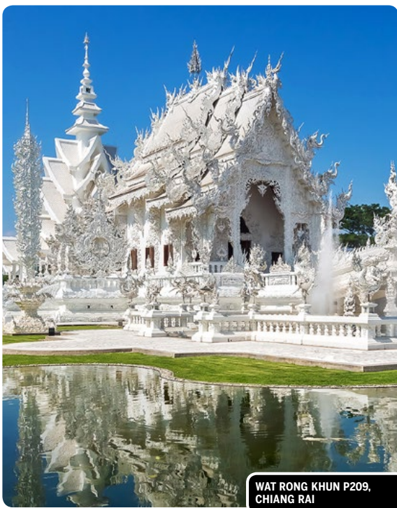
WAT RONG KHUN P209, CHIANG RAI