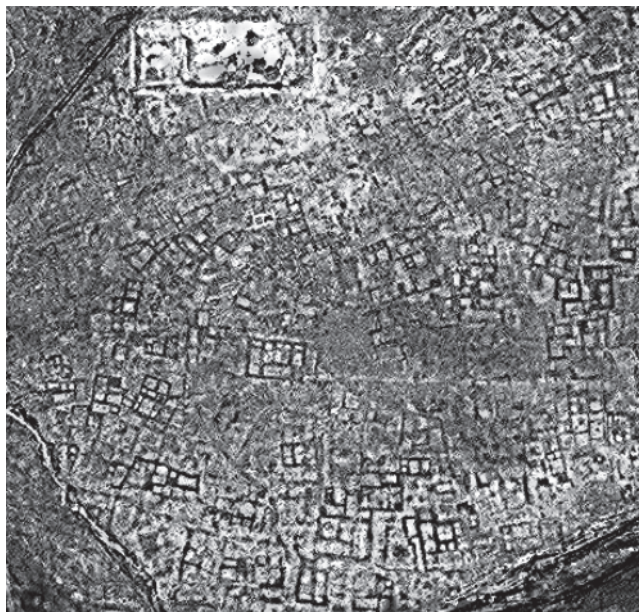
Figure 1.5 Quickbird and WorldView-1 satellite image of Tanis, Egypt, processed using band combinations, high pass filtering and additional techniques.

locate archaeological evidence before any fieldwork is ever conducted and the work of Sarah Parcak is especially pioneering in the methodology used. Through satellite image analysis Parcak has possibly located a major site, the Middle Kingdom capital of Itj-tawy-Amenemhat (see 7.1), as well as entire streets of houses in the Third Intermediate Period capital of Tanis (Figure 1.5; see 9.3). Her analyses suggest that a number of ancient settlements in Egypt may still be preserved – and therefore are excavatable.