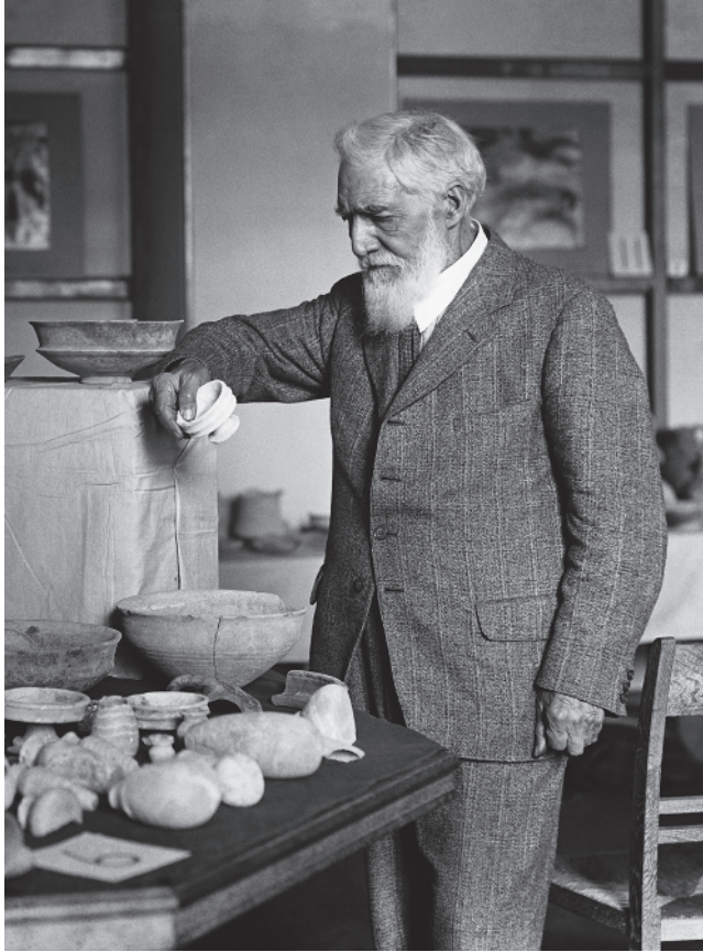
Figure 1.4 British archaeologist Sir William Matthew Flinders Petrie (1853–1942) with pottery he excavated in southern Palestine, exhibited at University College London ca. 1930.

importance of field photography, as well as keeping detailed records, maps, and drawing books of everything he excavated. In his early years in Egypt he excavated the large cemeteries at Naga el-Deir, and also at the sites of Coptos/Quft and Deir el-Ballas.