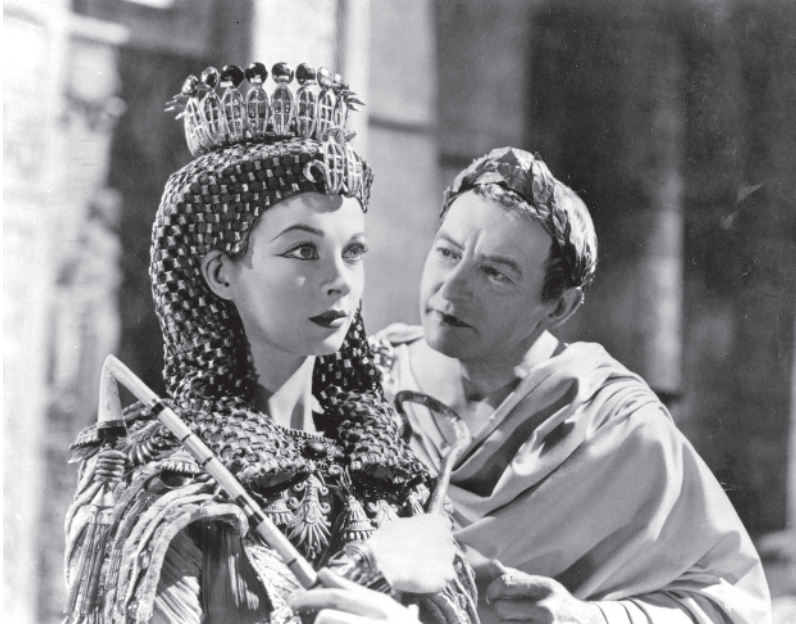
Figure 1.8 Vivien Leigh as Cleopatra (VII) with Claude Rains as Julius Caesar, in the 1945 film of the George Bernard Shaw play Caesar and Cleopatra.

Archaeologists working in Egypt have also been the subject of films. They appear in Robin Cook's 1979 book Sphinx , which has nothing to do with sphinxes, and in the 1981 film version. The movie inside the movie of Woody Allen's 1984 Purple Rose of Cairo begins with an adventurer-explorer (archaeologist?) in an Egyptian tomb, but he is quickly whisked off to Manhattan for a madcap weekend. Perhaps the most famous film archaeologist is Indiana Jones, who in the 1981 Raiders of the Lost Ark takes advantage of his university's liberal policy on academic leave to keep the Nazis from finding The Ark in their fairly informal excavations in Egypt. Stargate (1994) takes a somewhat naive Egyptologist to the other side of the universe where the Egyptian sun god Ra is up to no good.