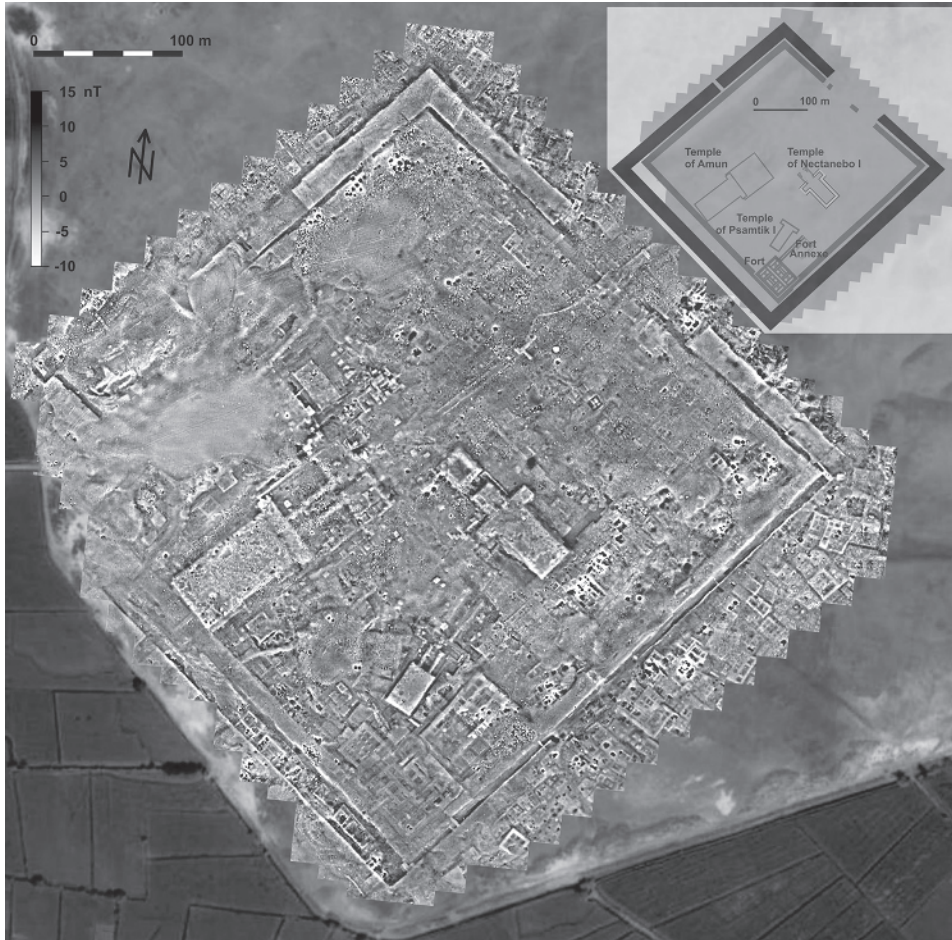
Figure 1.7 Tell el-Balamun, magnetic map of the temple enclosure.

to be studied by ceramic analysts. Philologists and Egyptologists are needed on excavations of pharaonic sites, and classical scholars on excavations of Greco-Roman sites. Highly trained specialists in different disciplines are also frequently needed, such as the nautical archaeologists who have studied the ship timbers at the pharaonic harbor of Mersa/Wadi Gawasis on the Red Sea (see Box 7-A).