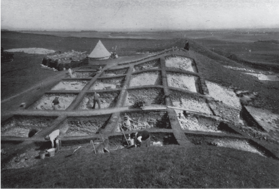
Figure 1.6 Wheeler excavation squares at a site.

technique; Figure 1.6), or the more recent method of excavating in Harris “stratigraphic units,” where each stratum, feature (such as a hearth), or architectural component is given a separate number in order to establish a graphic “matrix” to identify the sequence of these units. The Harris methodology is useful for recording strata of many different types of sites – from strata of a few centimeters often encountered at prehistoric sites to tomb structures and their interior deposits to large, open area excavations of features and architecture.