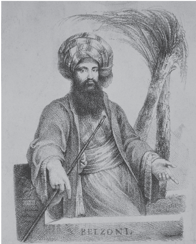
Figure 1.3 Giovanni Battista Belzoni (1778–1823). Engraving.

Scholarly expeditions to Egypt were also conducted in the earlier 19th century. Jean-François Champollion (1790–1832), and Ipollito Rosellini (1800–1843) from Pisa, recorded Egyptian monuments in the 1820s. A Prussian named Carl Richard Lepsius (1810–1884) traveled up the Nile as far as the site of Meroe, in northern Sudan, and published his 12-volume Denkmaeler aus Aegypten und Aethiopien ( Monuments of Egypt and Ethiopia ) from 1849 to 1859. This great work is still the most important 19th-century record of Egyptian monuments. John Gardner Wilkinson (1797–1875) spent the years 1821 to 1833 in Egypt, as well as making later visits, and recorded many tomb and temple scenes and inscriptions in great detail. He not only traveled to the major ancient sites in the Nile Valley, but was also the first to record some remote sites in the desert.